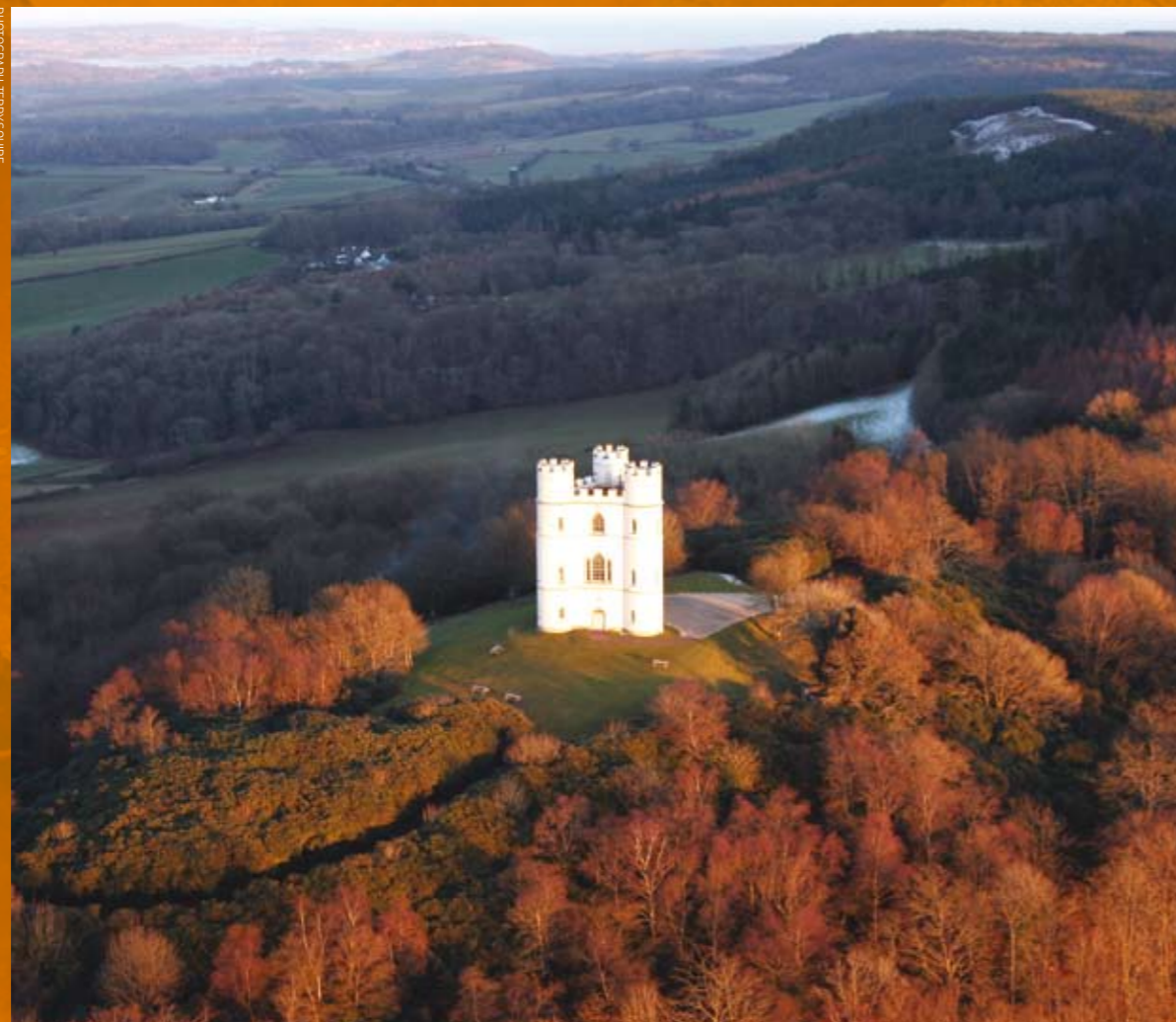
Haldon Belvedere from the air