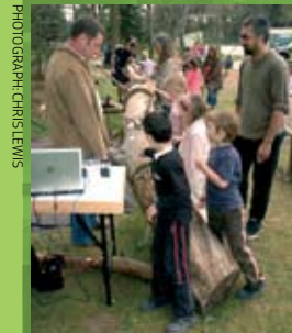
15 Visitors enjoying the Kayagum , wired up with contact microphones, Easter Bank Holiday 2007

Haldon's mobile café is open every weekend and on Bank Holidays, selling delicious ice creams, filled crêpes and organic fruit drinks.