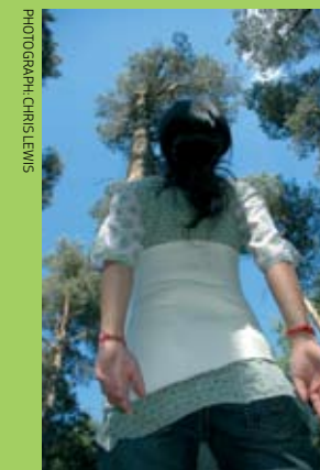
10 Felt sling prototype, Haldon Forest 2006