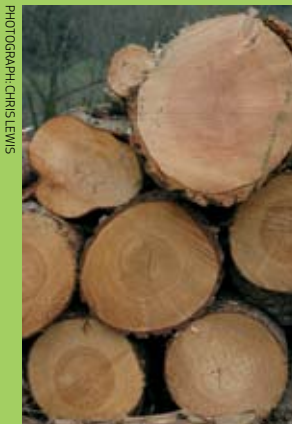
05 Douglas Fir timber at Haldon