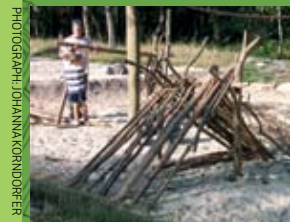
06 Den building at Haldon