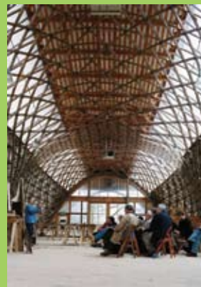
01 Downland Gridshell, built in 2002 for the Weald and Downland Open Air Museum. Edward Cullinan Architects