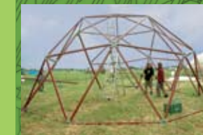
07 Geodesum, Bude erecting a geodesic dome