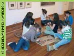
04 Coombeshead Community College students taking part in Enquire programme

Craftsman Sean Hellman has been working with sections of the different tree species grown at Haldon to reveal the qualities of the wood within. He is also starting to work on developing a 'timber trail'.