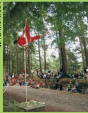
12 Jeremiah Krage performance during The Big Picnic, Haldon Forest Park, 13 August 06